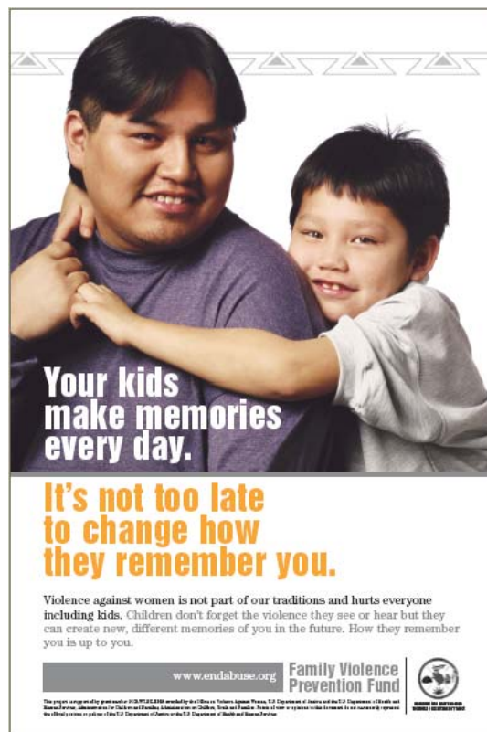
FAV Poster, created in collaboration with Mending the Sacred Hoop

Ultimately, for an organization to achieve authentic cultural “competence,” there has to be real power sharing.