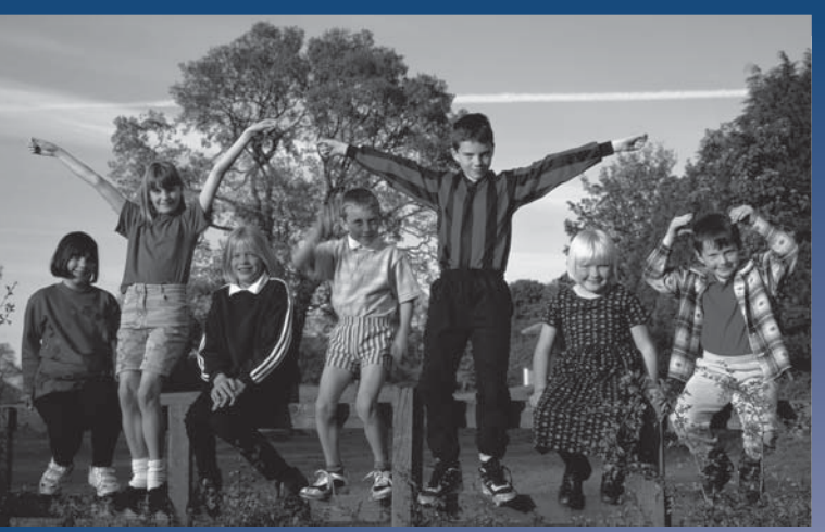
Lessons Learned from the Greenbook Project Directors

Project Leadership in Multi-System Change Efforts to Address the Co-Occurrence of Domestic Violence and Child Maltreatment